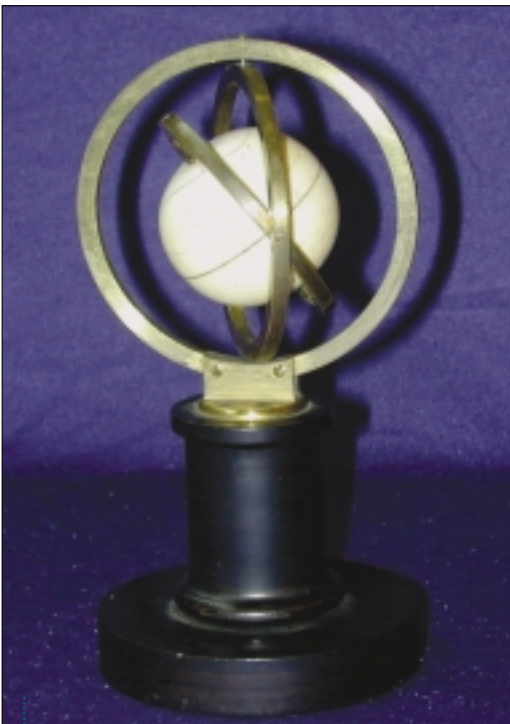
Figure 4 - The specimen found at the Kepler-Gymnasium in Tübingen, overall height 16.2cm.

With respect to the second difference, the draughtsman of Figure 3 has perhaps omitted the spool at point e to illustrate better that the bearings are point suspensions. For that, also the mainly covered counterpart of the conical pivot at e is indicated by the oversized brim of a bush (compare Figure 5). The bearings can be adjusted by screws