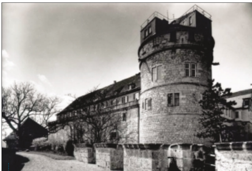
Figure 7 - The North-East Tower of the Castle of Tübingen before dismantling the observatory in 1955 (photo: the City of Tübingen).

tive scientific phase. His first task was to consolidate and to extend the observatory. In parallel, he continued his work on publishing the map of Württemberg. This occupation and his lectures stimulated in turn the expansion of his mathematical methodology as well as the development of devices for geodetic measurements and physical experiments. In several textbooks and many scientific papers, he documented this activity (Reist (1965) has compiled a detailed publication list). Within the scope of the paper at hand, it is however only possible to outline the most important topics: