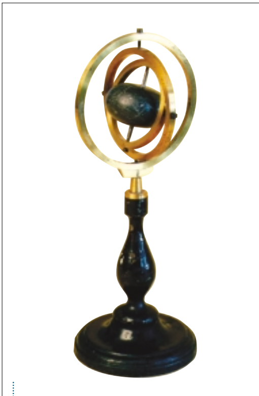
Figure 1 - Specimen of the Lycée Fabert, Metz, France, to illustrate the dynamic behaviour of gyros, overall height 35cm (photo: Henri Chamoux, Paris, INRP).

It should be added that gyros suspended by gimbals do not serve only as navigation aids. Control moment gyros are another notable application. They are employed as stabiliser for the rotational motion of mainly satellites and rarely also of ships and monorail vehicles (Magnus 1971, Sorg 1976). Furthermore, four of the most accurate gyroscopes ever built are used at present aboard the satellite Gravity Probe B in order to test Einstein's General Theory of Relativity (Kasdin and Gauthier 1996). All these examples illustrate the technical and scientific significance of the invention of gyros with cardanic suspension. Nevertheless, L. Foucault is not the originator of that mechanical principle. He was familiar with it because such gyros were especially popular in France during the 19th century: prior to the discovery of their potential as measurement device, they were already employed in numerous French schools to explain the precession of the earth rotation axis. This matter was born of the initiative of the French mathematician and politician Pierre-Simon Laplace, who recommended introducing that kind of gyros as teaching aid (Ofterdinger 1885). Figure 1 shows as an example the specimen of the Lycée Fabert, Metz, France, which was built likely between in 1860 and 1880. Here, the rotor and the two circular gimbals are enclosed by a third ring being part of the pedestal. The rotor is made of lead and