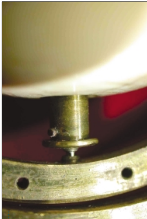
Figure 5 - Rotor bearing of the specimen found.