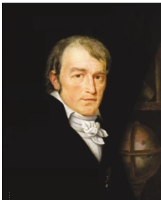
Figure 2 - Johann Gottlieb Friedrich Bohnenberger, June 5, 1765 – 19 April 1831 (oil painting of F.S. Stirnbrand, 1831).