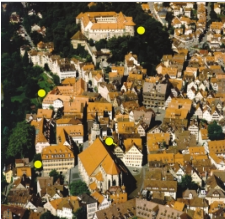
Figure 6 - Current view of the upper old city centre of Tübingen: No. 1: North-East Tower of the castle, No. 2: Tübinger Stift, No. 3: former main building of the University, No. 4: house of Buzengeiger's workshop.

With these conditions, the young professor began a long, very produc-